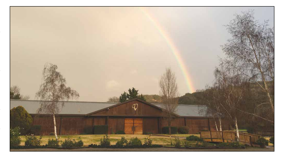
Varian Barn with Rainbow

In continuing with its tradition of educational excellence, Varian Arabians lends its facilties to hand-selected